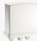
POS-4001 Outdoor High Power PoE Splitter (12V)