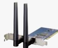
WNC-0601 N_Max Wireless PCI Card