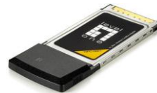
N_Max Wireless CardBus Adapter